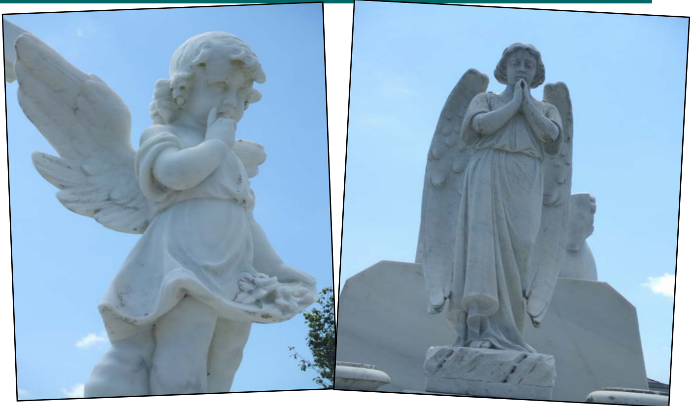
Images of the 19th century made in Carrara marble.